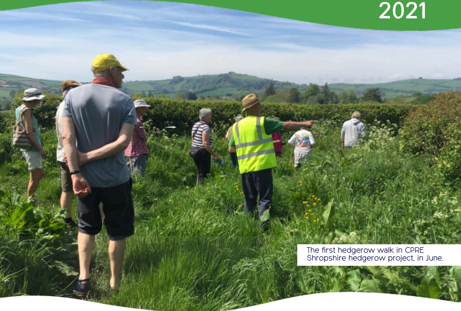
The first hedgerow walk in CPRE Shropshire hedgerow project, in June.

Exclusive Member Invitation inside: CPRE Shropshire Members' social event: Thursday 9th September.